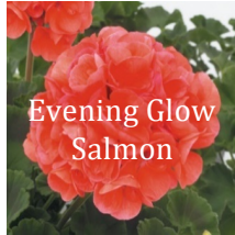
Evening Glow Salmon