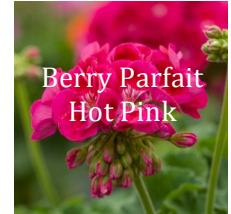
Berry Parfait Hot Pink